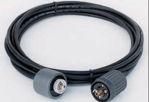
MA-7RC Remote Switch Assembly (20')