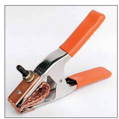
MA-7003 Braided Contact Clamp (3 inch Grip)