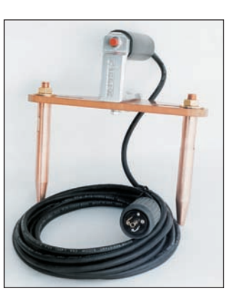
MA-7001 Dual Horizontal Prod Assy (adjustable tips)