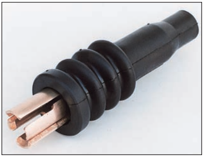
MA-7EC 4/0 Eitherend Connector