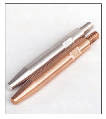
MA-7ST Replacement Prod Tips (aluminum or copper)