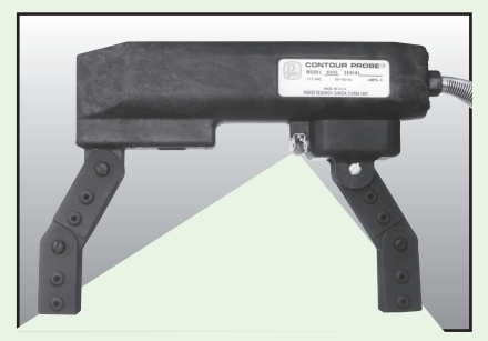
B300 - A.C. Contour Probe. Available with Y300 Yoke Light. Also available with GFI Plug.