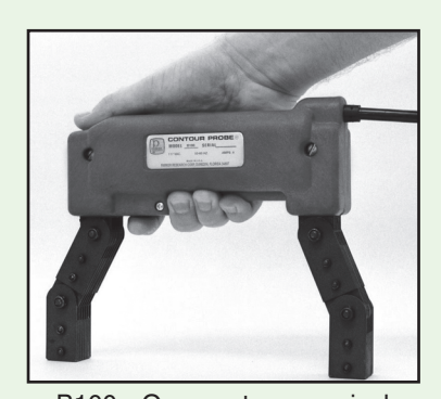
B100 - Our most economical A.C. Contour Probe. Available in 115VAC and 230VAC. May be ordered with the Y400 Yoke Light at extra cost.