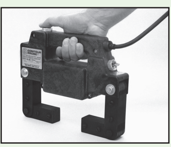
A210 - Heavy Duty A.C. Contour Probe. Strongest A.C. Field Yoke available. Model DA200 available for A.C./D.C. Operation.