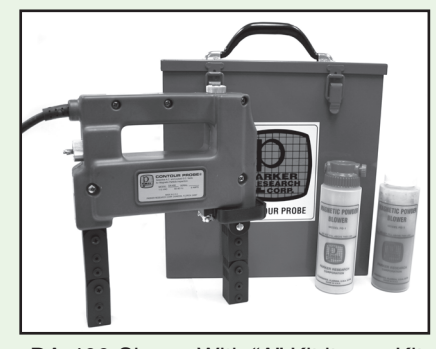
DA-400 Shown With "A" Kit items. Kit items are available with dry powder and Wet Fluorescent inspection mediums. Including Black Light and Steel Carrying Case.