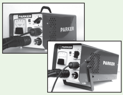
DA750 & DA1500 - Portable Mag units. Heavy duty 750 or 1500 AMP. Available with all accessories.