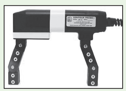
UW115 & UW12 Underwater A.C. and D.C. Yokes.