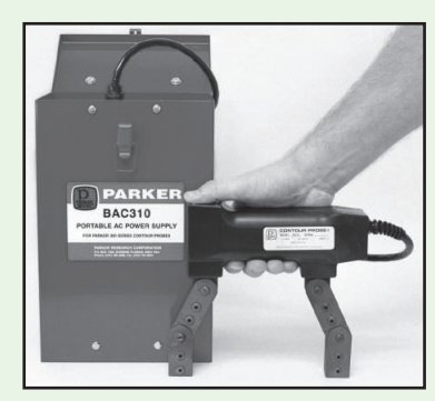
BAC310 - Portable, Stand alone Battery Inverted 115VAC Power Supply. Operate A.C. Yokes or other Instruments where normal power sources are unavailable.