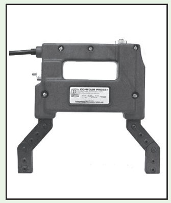
DA400 - Contour Probe. Most popular A.C./D.C. Yoke. Available in various Kit forms. Y400 Yoke Light additional.