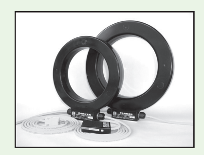
PL8 & PL10 - Magnetizing Coils. 8" & 10" I.D. Complete with Carrying Case.